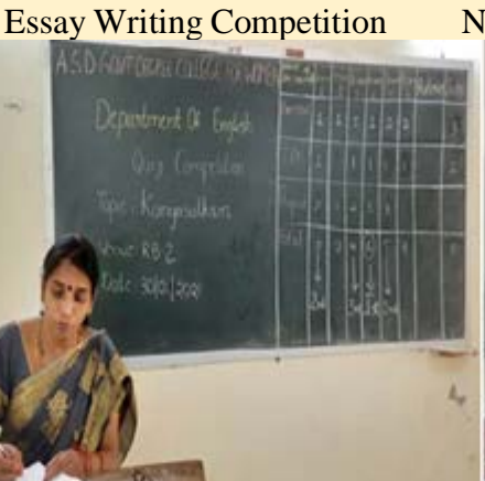
Quiz Feedback to Students