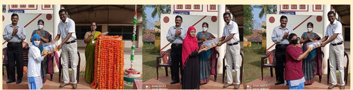
Prize Distribution by the Principal

On the occasion of Republic Day, literary competitions were conducted by the Departments of English and Telugu on 25 January 2021 and the prizes were distributed by the Principal on the Republic Day.