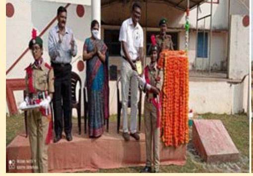
Receiving Prize by NCC Best Cadet