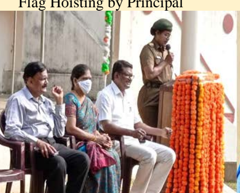
NCC Officer announcing parade