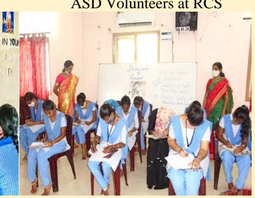
English Essay Writing