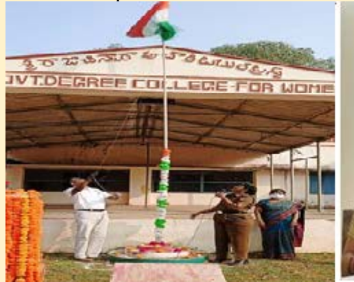
Flag Hoisting by Principal