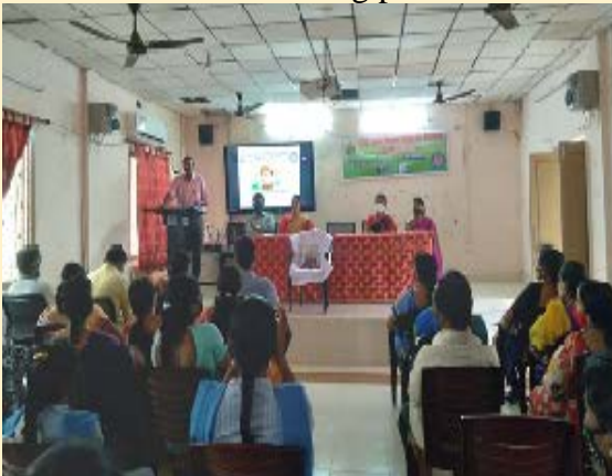
Parakram Diwas Celebrations