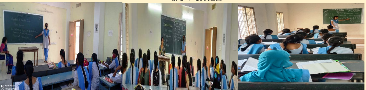
AqT Department Seminars