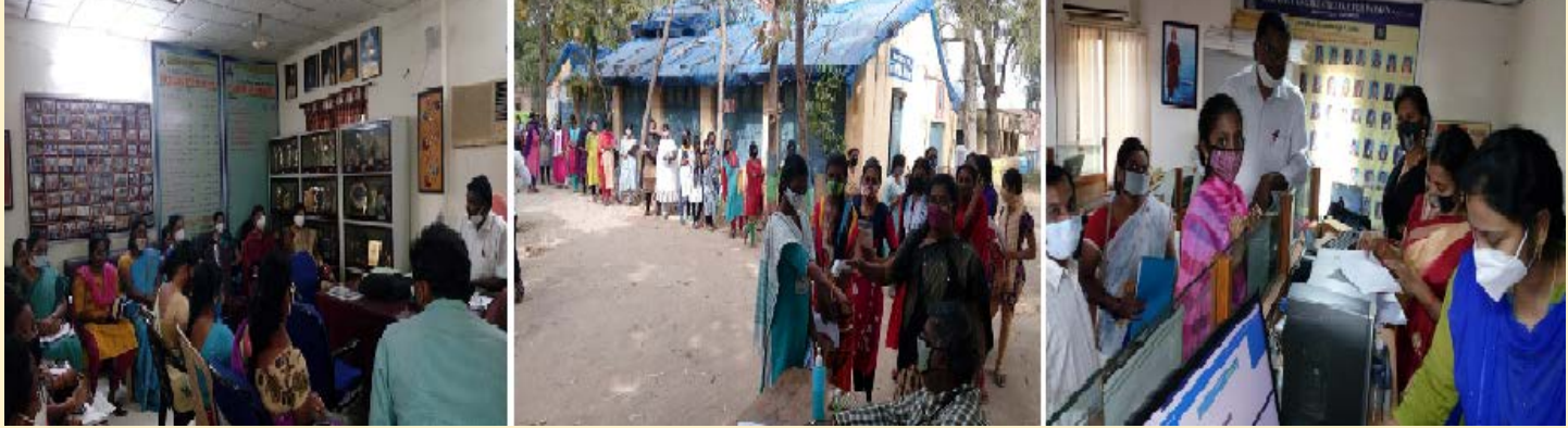
Staff Meeting with Principal

5 Help Desks were placed at different locations in the college campus for Web Options and Student Confirmation.